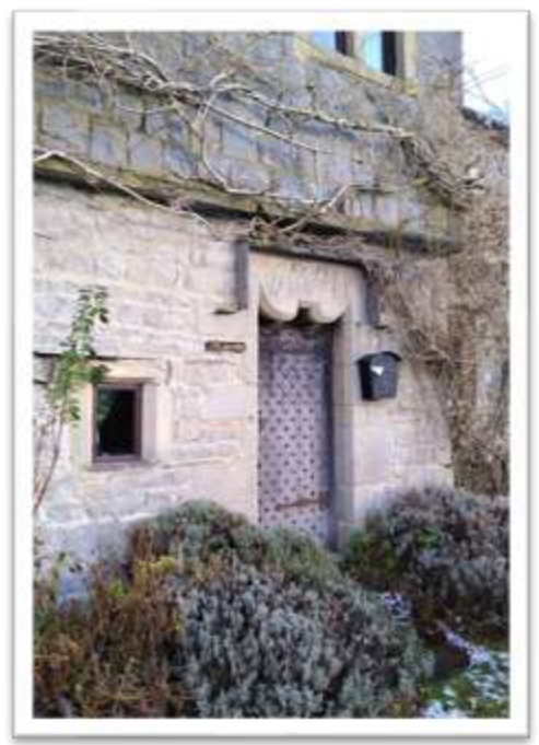
Ahead of us we see a large white house – keep an eye open for a bridleway on the

Follow this up to Wharfe – an ancient hamlet of just a few houses – one of which is a manor house dating from 1715 – probably one of the most photographed houses in the Yorkshire Dales.